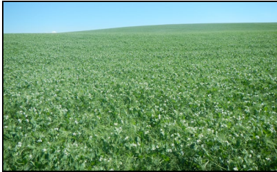
Direct Seed Incentive and Education Program expanded.