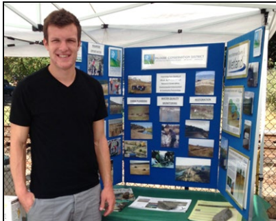
Internship program established to provide interns with valuable hands-on experience in natural resources conservation, enhance local participation in natural resource conservation, and raise community awareness of local conservation issues.