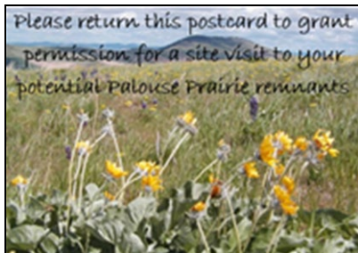
Palouse Prairie education and outreach campaign launched.